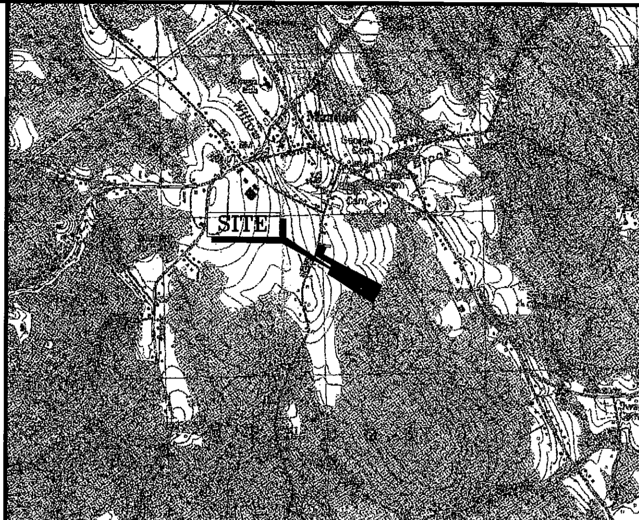
LOCUS MAP 1" = 2,000'

WORCESTER DISTRICT REGISTRY OF DEEDS-WORCESTER, MA PLAN BOOK 961 PLAN 82 Received 1/14/2022 Sheet 1 of 1 Fee $105 ATTEST: Kathryn A. Torney Register