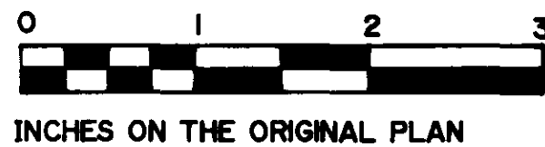
INCHES ON THE ORIGINAL PLAN

ANDREWS SURVEY & ENGINEERING, INC. UXBRIDGE, MASS.